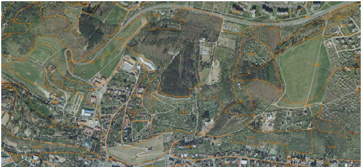
Soil bonity map

Short description of the situation on the area (about 400 characters)